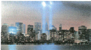
Proud Supporter - 5