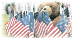
Proud Supporter - 3