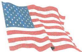
Proud Supporter - 2