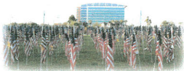
Proud Supporter - 2